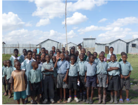
Grades 5 - 8

One of the classes that I taught was in an urban slum school to a class of 35 student's grades 5 - 8, I used the UCSL Virtues, Pathways to Power curriculum.