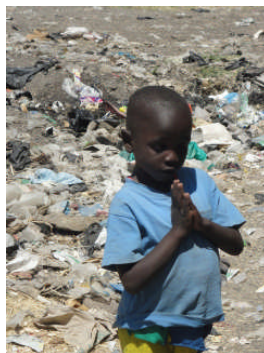
Boy in the slums praying

At the first class I realized that the stories used would have no meaning for children in Africa living in the slums, even the craft projects weren't relevant. As I searched for relevant examples I began to wonder how many students over the years could have benefited from a new approach to teaching. What I discovered is that in order to transcend the language and cultural differences that I needed to meet them where they are.