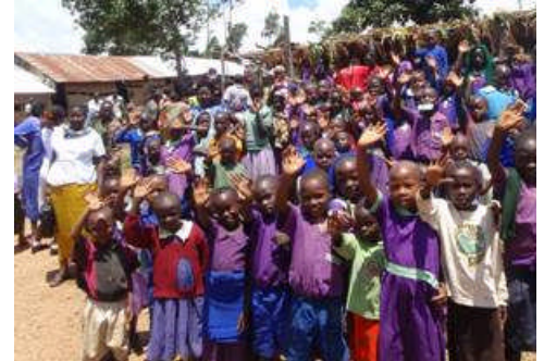
Love and light sparkling from beautiful faces

In such joy, love, and abundant blessings,